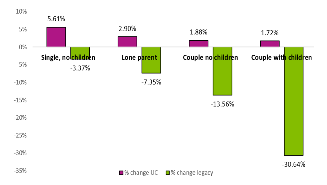
Table 8: Percentage change in weekly Council Tax reduction compared to current scheme in 2024/25 by household type.

3.13 A total of 1,651 households would see a reduction of more than £5 per week by using this model and 235 households would lose all support. This is set out in the table below.